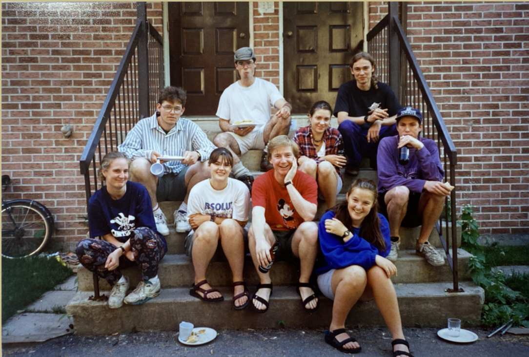
Featured photo from the archive: Outlook 1993